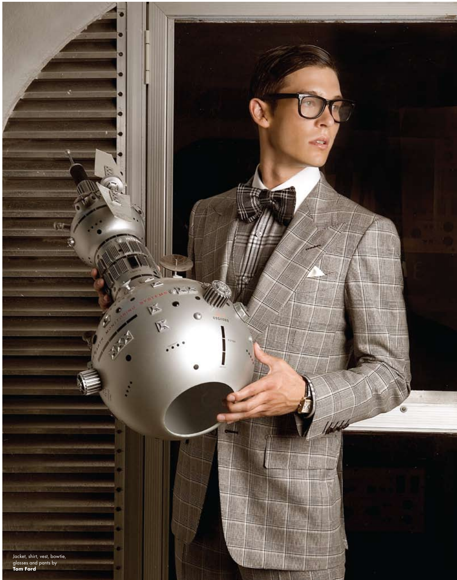
Jacket, shirt, vest, bowtie, glasses and pants by Tom Ford